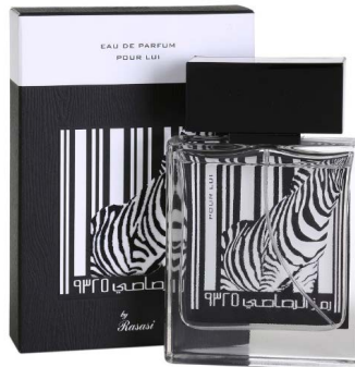
Zebra Rasasi Inspired By: Creed Aventus