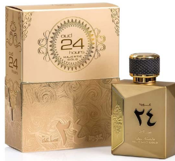
Oud 24 Hours Majestic Gold Inspired By: Armani Stronger with you Leather