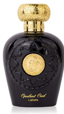
Opulent Oud Inspired By: Armani Prive Oud Royal