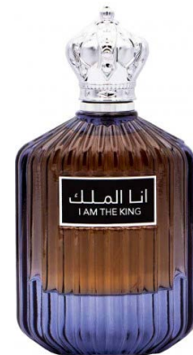
I Am The King (Ana Al Malik) Inspired By: Dior Sauvage