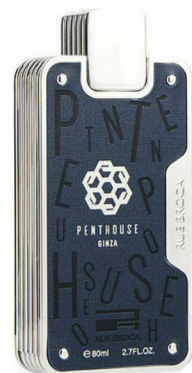
Penthouse Ginza Inspired By: Paco Rabanne Invictus