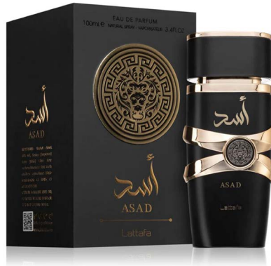
Asad Inspired By: Dior Sauvage Elixir