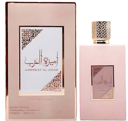
Ameer Al Arab Prive Rose Inspired By: Delina Exclusif