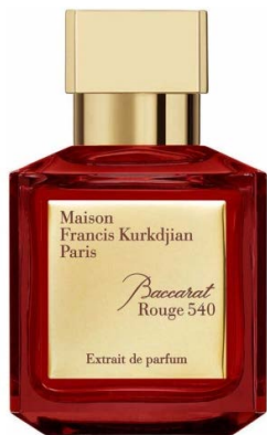
BARAKKAT Rouge 540 Extrait Inspired By: Rouge 540 Extrait