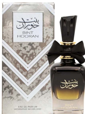
Bint Hooran Inspired By: Carolina Herrera Good Girl