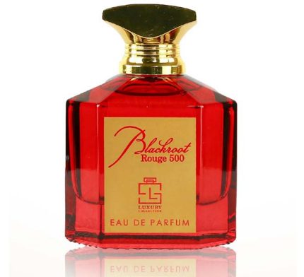
Blackroot Rouge 500 Inspired By: Baccarat Rouge 540