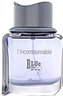
Blue for Man 2 Inspired By: Versace Dylan