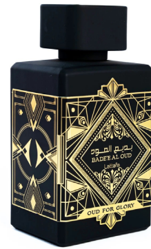
Badee Al Oud Inspired By: Initio Oud for Greatness