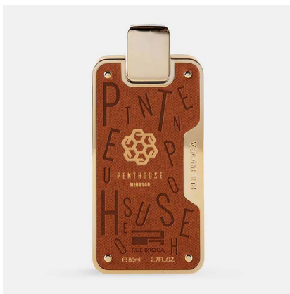
Penthouse Windsor Inspired By: LV Ombre Nomad