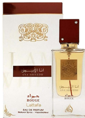
Ana Abiyedh Rouge Inspired By: Baccarat Rouge 540