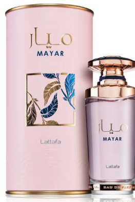
Mayar Inspired By: Armani - My way