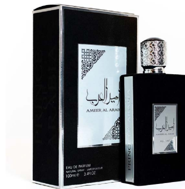
Ameer Al Arab Inspired By: Spice Bomb – Victor Rouf