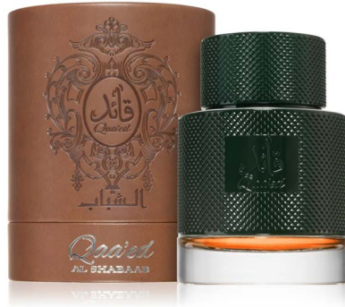
Qaa'ed Al Shabaab Inspired By: Guerlin Cuir Intense