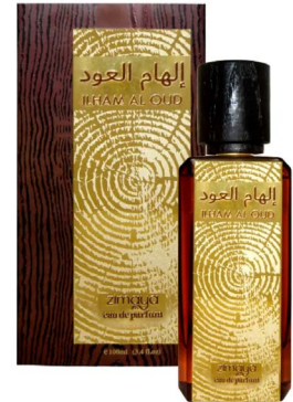
Zimaya Ilham Al Oud Inspired By: LV Ombre Nomad