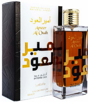
Ameer Al Oud Intense Oud Inspired By: By The Fireplace