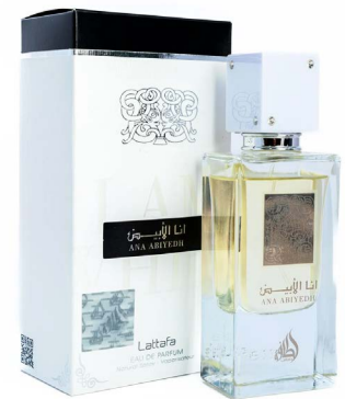
Ana Abiyedh Black Inspired By: Erba Pura - Xerjoff