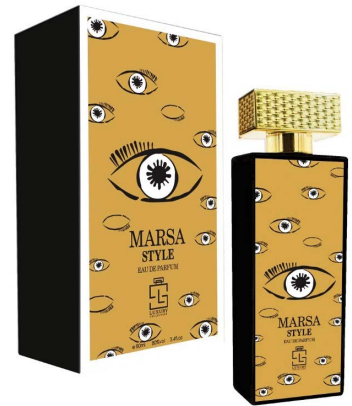
Marsa STYLE Inspired By: Memo Paris