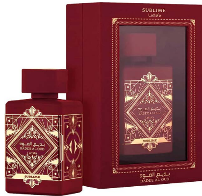
Badee Al Oud Sublime Inspired By: Kayali Eden Juicy Apple