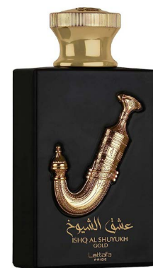
Ishk Al Shuyukh Gold Inspired By: Rosendo 5