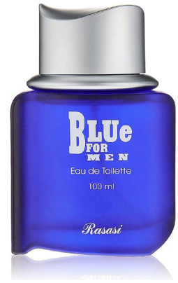
Blue for Man Inspired By: Blue De Channel