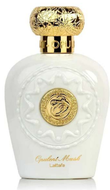
Opulent Musk Inspired By: Baccarat Rouge 540 but with more muskiness