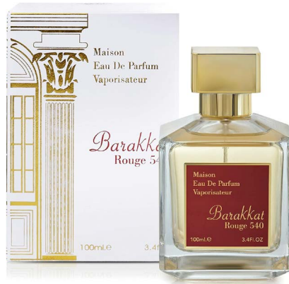
Barakkat rouge 540 Inspired By: Baccarat Rouge 540