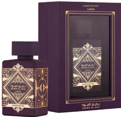
Badee Al Oud (Amethyst) Inspired By: Initio