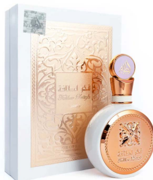
Fakhar Lattafa (Pride of Lattafa) Rose Gold Inspired By: L'interdit by Givenchy