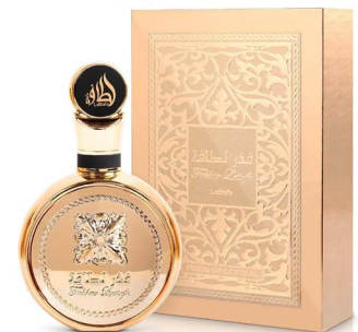
Fakhar Lattafa (Pride of Lattafa) Gold Extrait Inspired By: 1Million Paco Rabanne