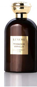
Tobacco Vanilla by Khalis Inspired By: Tom Ford Tobacco Vanilla