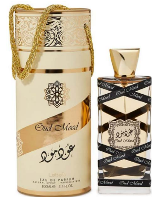
Oud Mood Inspired By: Lancome Bouquet