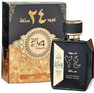
Oud 24 Hours Inspired: Tom Ford Black Orchid