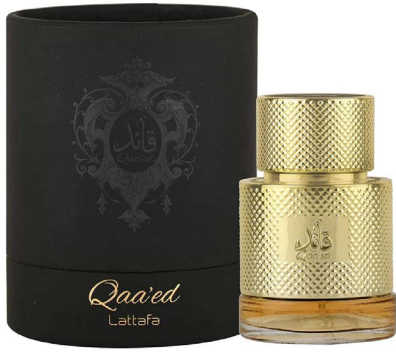
Qaa'ed Inspired: Dunhil Icon Absolute / Tom Ford Oud Wood