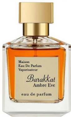
Barakkat Ambre Eve Inspired by – Grand Soir