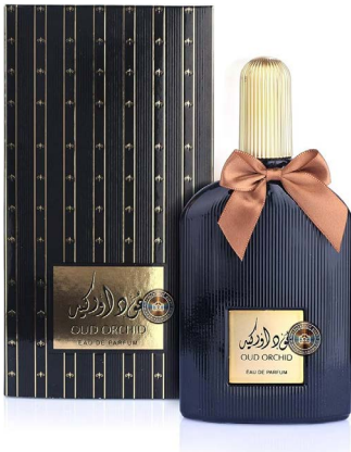
Oud Orchid Inspired By: Tom Ford Black Orchid