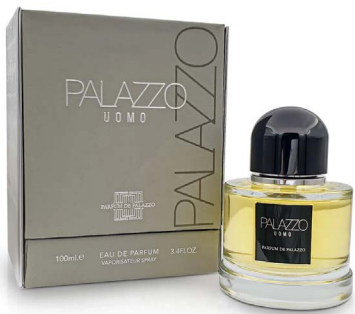
Uomo Plazzio Inspired: Armani Code